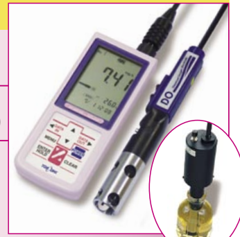
DO electrode for the incubator bottle

Note : For conducting BOD measurements, please place orders for the "main unit only" and the "DO electrode for the incubator bottle OE-470AA".