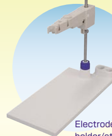
Electrode stand/ holder/attachment