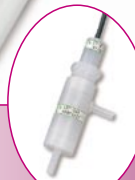
Electrical conductivity cell for pure water